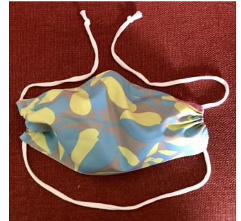
Front of mask—faces away from your mouth